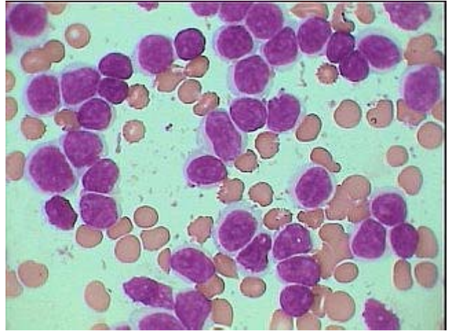
Prolymphocytes –relatively large lymphoid cells showing fine but dense nuclear chromatin pattern with distinct to indistinct single nucleoli, under Oil Imm.