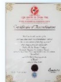
(NAAC Accredited with 'A' Grade)